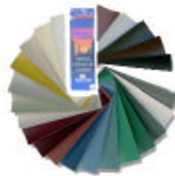
Royal Spectra-Coat waterborne technology has minimal heat absorption with maximum heat reflection